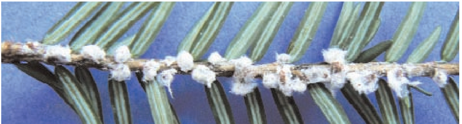
The HWA leaves a wool-like substance on along the stem at the leaf base of hemlock trees. Here the egg sacs are exposed.