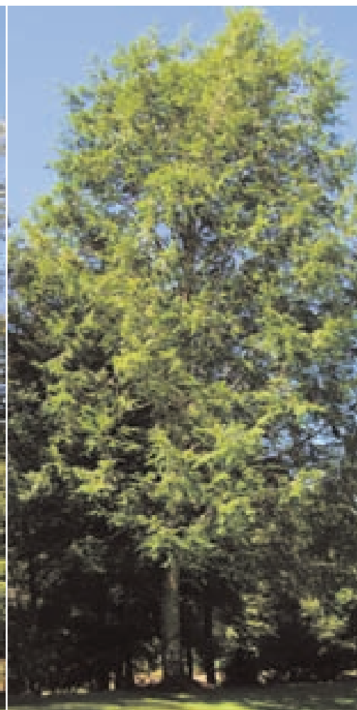
A hemlock tree treated with dinotefuran shows abundant new growth 2 years after treatment.

“In the more northern regions, where colder temperatures can help kill the overwintering adelgids, HWA may affect a tree more slowly — even infesting a tree for more than 10 years before the damage becomes substantial,” Cowles said. “But HWA is a persistent pest and will eventually cause significant damage to a stand if not addressed.”