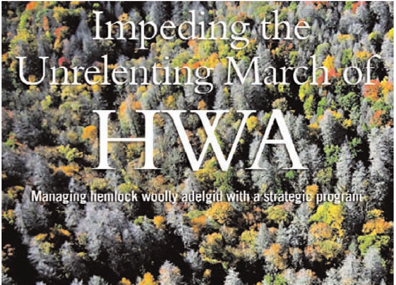
Dead or dying hemlock trees ravaged by hemlock woolly adelgid (HWA) throughout the Cataloochee Valley of the Great Smoky National Park in North Carolina.