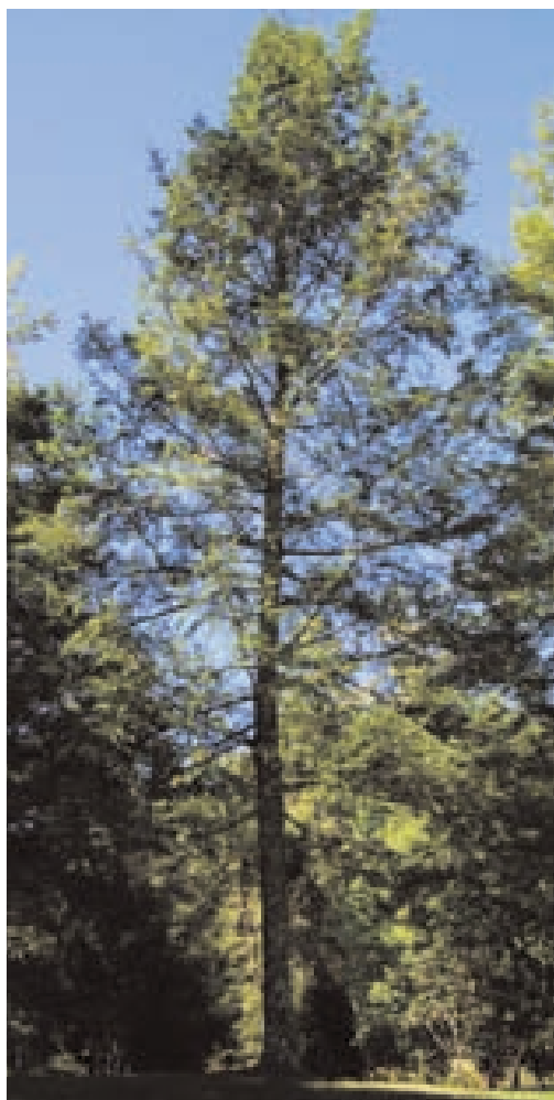
An untreated hemlock tree suffering from HWA. Very little new growth is present.